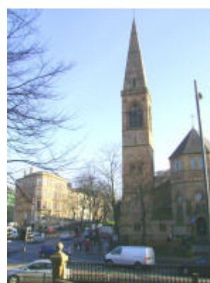
The Òran Mór – the renowned restaurant, bar and theatre, situated just across the road. http://www.oran-mor.co.uk/