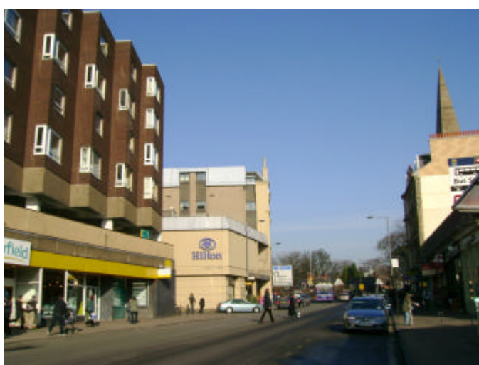
Exterior and streetscape